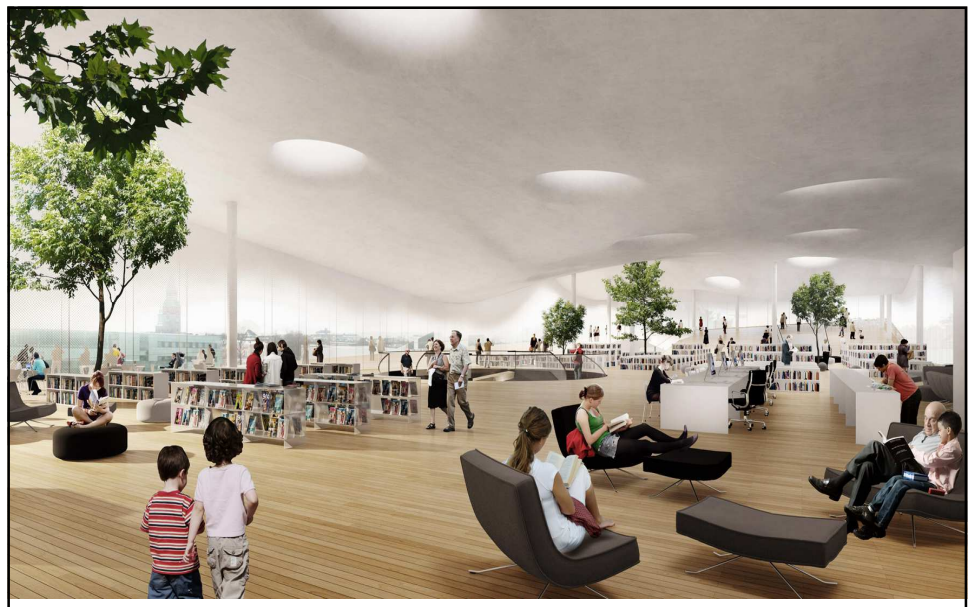
One of the strengths of the proposal is the rather different moods on the three floors of the building. The ground-floor level is strikingly impressive and attractive. Access from the ground-floor level to the upper floors creates a distinct, yet at the same time surprising, spatial sequence.