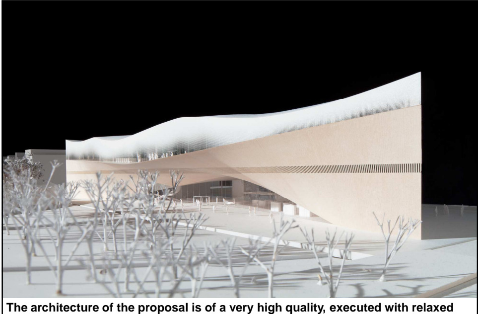
The architecture of the proposal is of a very high quality, executed with relaxed broad strokes and memorable. The proposal provides excellent premises for the development of a completely new functional concept for the library.