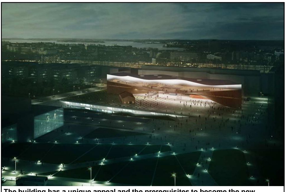
The building has a unique appeal and the prerequisites to become the new symbolic building which Helsinki residents, library users, as well as the staff will readily adopt as their own.