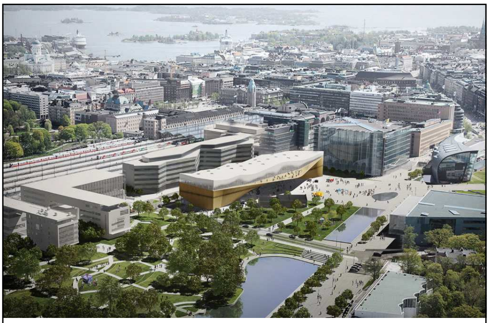
The building is confidently connected with its surroundings, while at the same time standing out and taking its place as an important public building. The building is inviting, easy to approach and identity with.