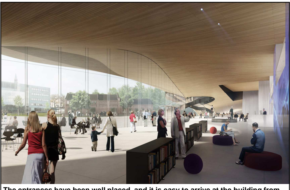
The entrances have been well placed, and it is easy to arrive at the building from all approach directions. The lobby arrangements enable the placement of the library functions immediately in the vicinity of the entrances.