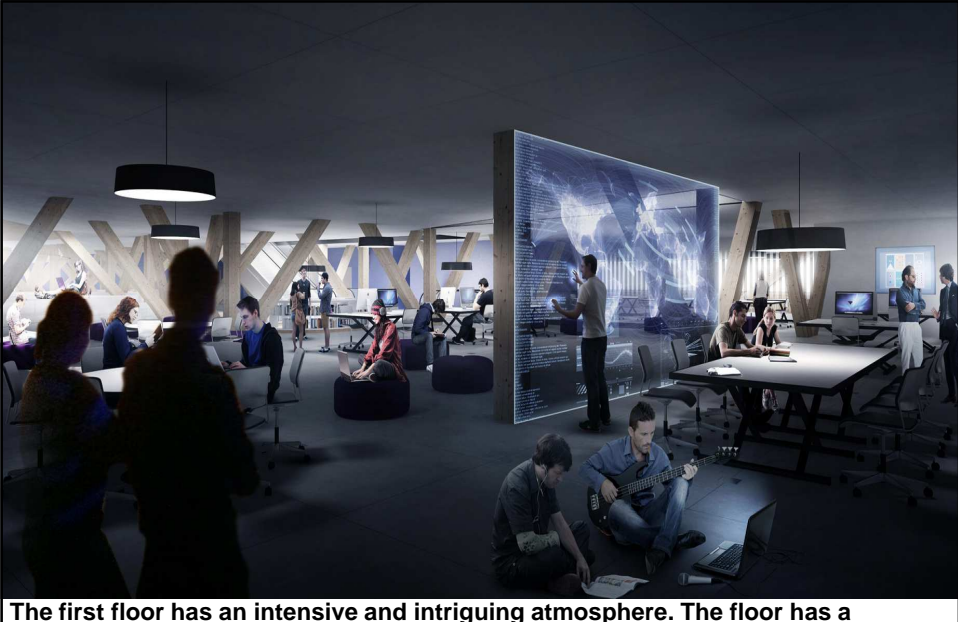
The first floor has an intensive and intriguing atmosphere. The floor has a workshop-like character and offers an inspiring centre for diverse functions, which conveys 'doing things' and 'activity'. The functions are present in an informal way and are both easily approachable and easy to use.