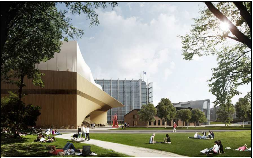
An extensive terraced area, called "citizens' balcony", is linked with the top floor. It adds, from many different viewpoints, a symbolic gesture to the form of the building and beckons the library users to take time to relax.