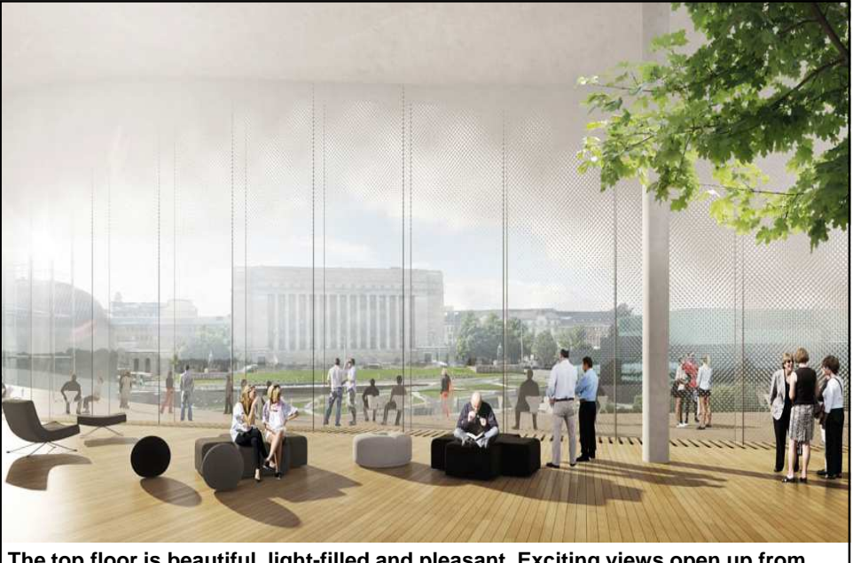
The top floor is beautiful, light-filled and pleasant. Exciting views open up from the spaces into the surrounding scenery. The free forms of the ceiling articulate the space pleasantly.